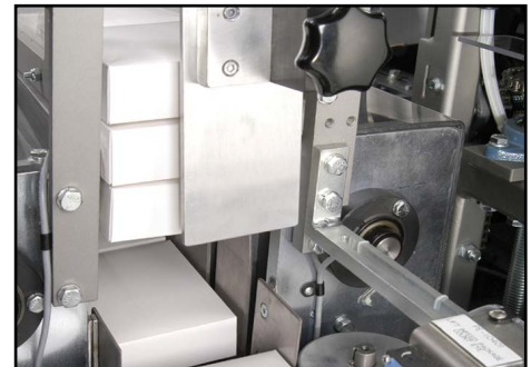
The complete case pack pattern is indexed to the case load station while first layer of next case load accumulates/elevates.

All sales are subject to our prevailing terms and conditions. Illustrations and specifications are subject to change without notice. Machines shown without guards are for illustrative purposes only. Guards are supplied and must be in place before operation.