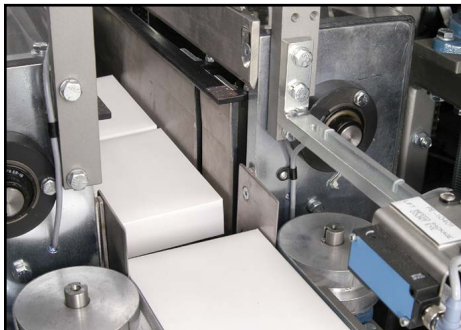
First layer of product, from the infeed conveyor, accumulates in a metered quantity inside the AS 100 stacker