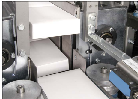
Servo-controlled lifting cleats elevate completed layer as second layer of product is formed, all in continuous motion.