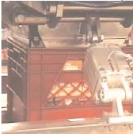
Pivot-Mounted container guide