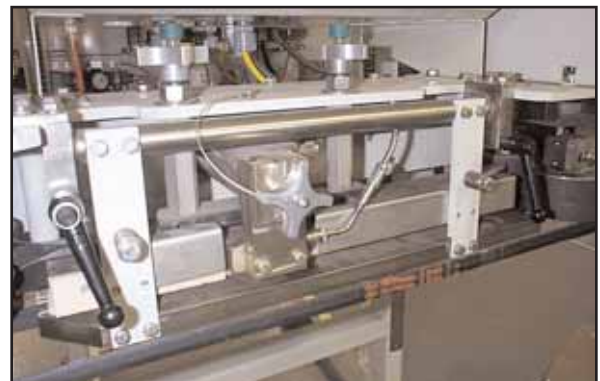
Simple, tool-less clean-out

All sales are subject to our prevailing terms and conditions. Illustrations and specifications are subject to change without notice. Machines shown without guards are for illustrative purposes only. Guards are supplied and must be in place before operation.